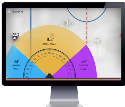
Understanding Angles To Complete A Bank Pass

Geometric Constructions On Ice - Geometry exists everywhere, even on a hockey rink. In this module, students must use their understanding of geometry and the coordinate plane to correctly place the points, line segments, and circles on the hockey rink.